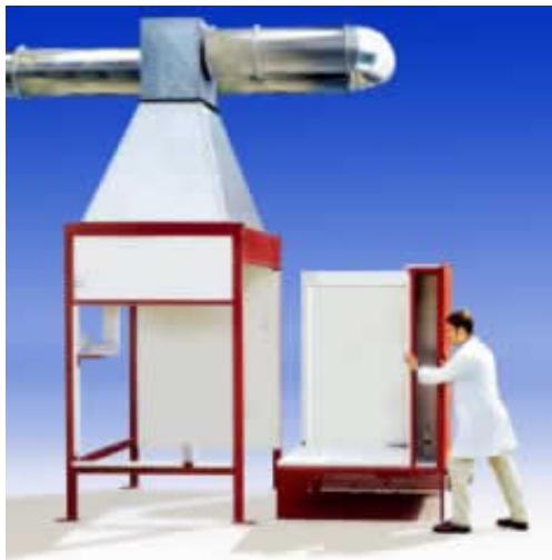
b : fixed frame with hood, collector, exhaust duct with measurement section