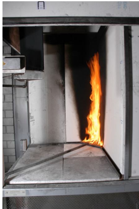
Fig. 3b : SBI-test on slab material