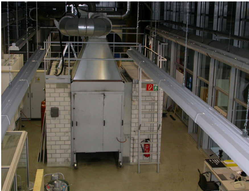
Fig. 3a : MPA-Otto-Graf-Institute fire department test laboratory with SBI–test apparatus

Figure 3a shows the SBI-test apparatus run at MPA-Otto-Graf-Institute fire department and Figure 3b shows a real SBI test on slab material.