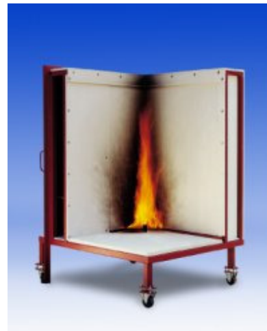
c : trolley