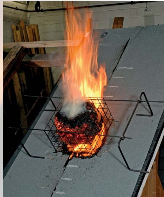
Testing of the fire resistance of roofs against radiant heat and flying brands acc. to DIN 4102-7 and DIN CEN/TS 1187