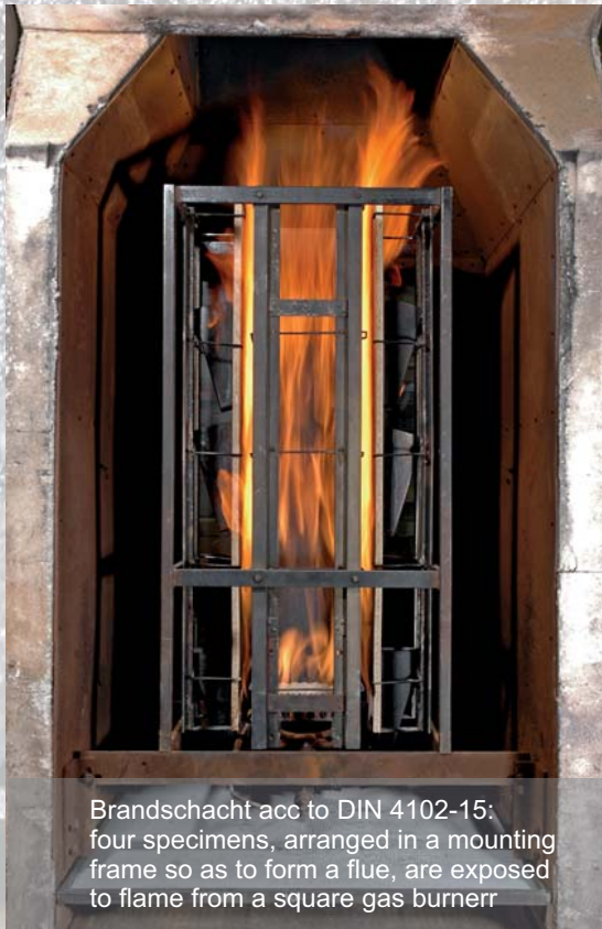
Brandschacht acc to DIN 4102-15: four specimens, arranged in a mounting frame so as to form a flue, are exposed to flame from a square gas burner