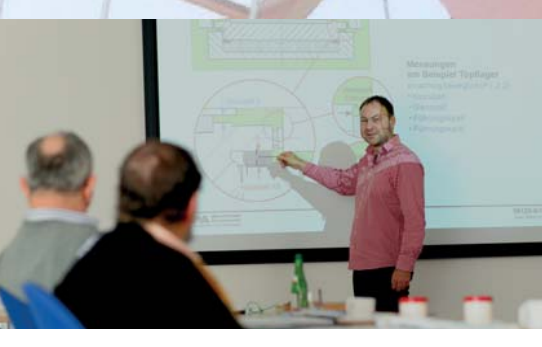
Training of experts in bearings in structural engineering