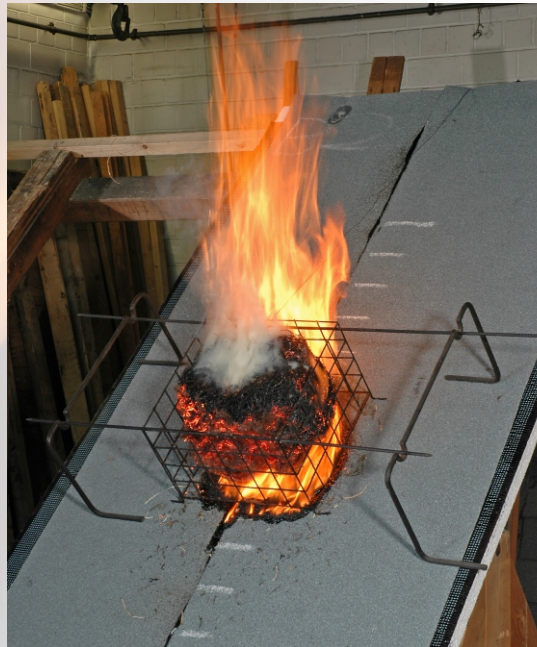
Testing of the fire resistance of roofs against radiant heat and flying brands acc. to DIN 4102-7 and DIN CEN/TS 1187