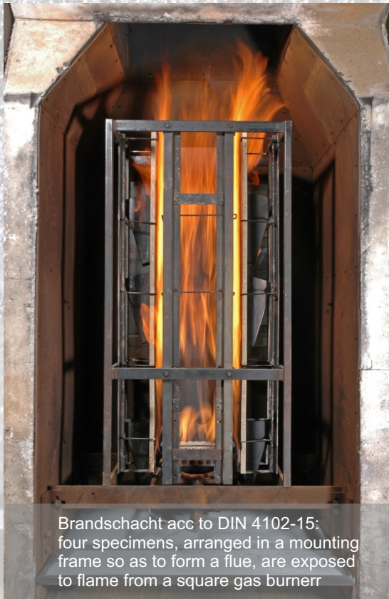
Brandschacht acc to DIN 4102-15: four specimens, arranged in a mounting frame so as to form a flue, are exposed to flame from a square gas burner